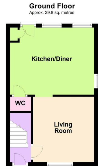
Total area: approx. 62.3 sq. metres